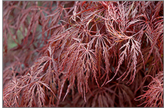
Crimson Queen Japanese Maple foliage

Crimson Queen Japanese Maple is recommended for the following landscape applications;