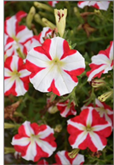
Amore King of Hearts Petunia flowers

Amore King of Hearts Petunia is recommended for the following landscape applications;