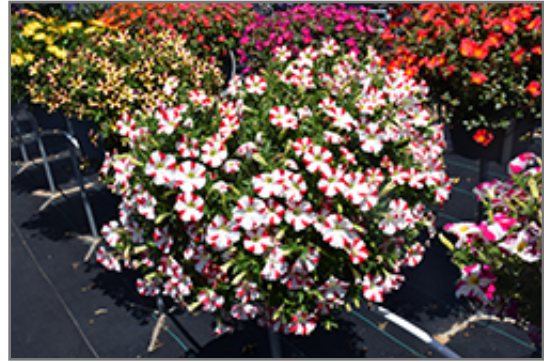
Amore King of Hearts Petunia in bloom

Amore King of Hearts Petunia will grow to be about 12 inches tall at maturity, with a spread of 14 inches. When grown in masses or used as a bedding plant, individual plants should be spaced approximately 10 inches apart. Its foliage tends to remain dense right to the ground, not requiring facer plants in front. This fast-growing annual will normally live for one full growing season, needing replacement the following year.