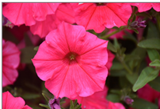
Supertunia Vista Paradise Petunia flowers

Supertunia Vista Paradise Petunia is recommended for the following landscape applications;