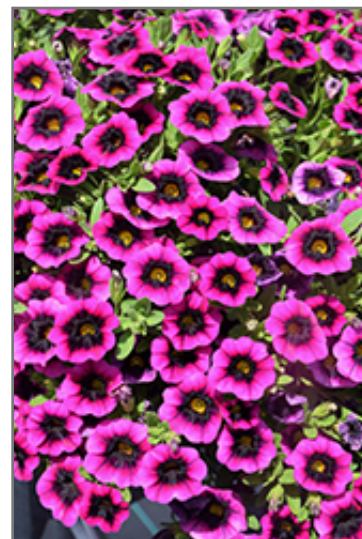
Superbells Blackcurrent Punch Calibrachoa flowers

Superbells Blackcurrent Punch Calibrachoa is recommended for the following landscape applications;