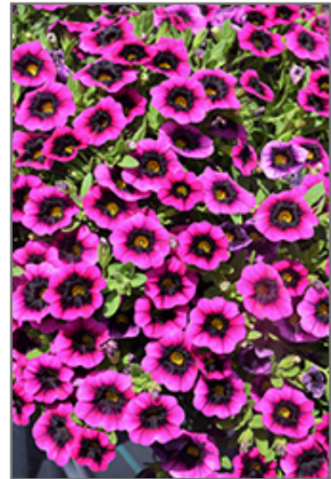
Superbells Blackcurrent Punch Calibrachoa flowers

Superbells Blackcurrent Punch Calibrachoa is recommended for the following landscape applications;