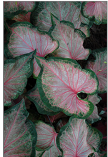
Heart to Heart Chinook Caladium foliage

Heart to Heart Chinook Caladium is recommended for the following landscape applications;