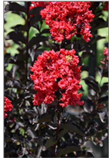
Ebony Fire Crapemyrtle flowers