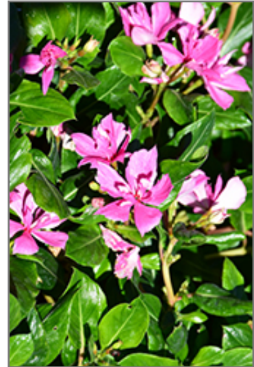
Soiree Kawaii Double Pink Vinca flowers

Soiree Kawaii Double Pink Vinca is recommended for the following landscape applications;