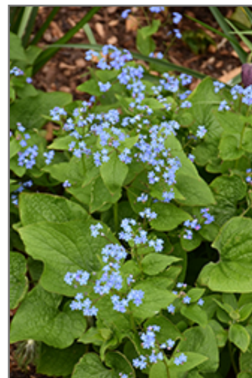
Siberian Bugloss flowers