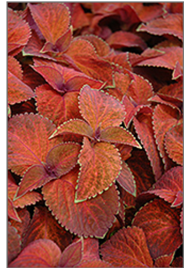
Wizard Sunset Coleus foliage Photo courtesy of NetPS Plant Finder

Wizard Sunset Coleus is recommended for the following landscape applications;