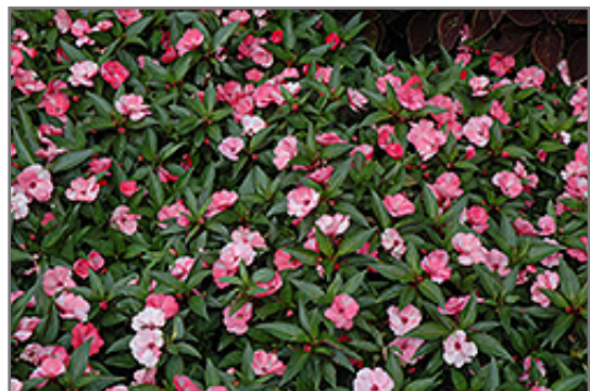
SunPatiens Spreading Pink Flash New Guinea Impatiens in bloom