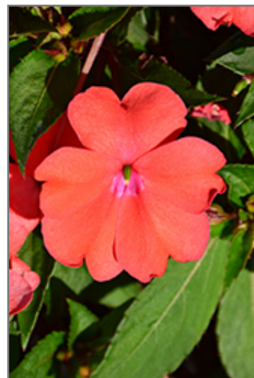
SunPatiens Spreading Corona New Guinea Impatiens flowers

SunPatiens Spreading Corona New Guinea Impatiens is recommended for the following landscape applications;