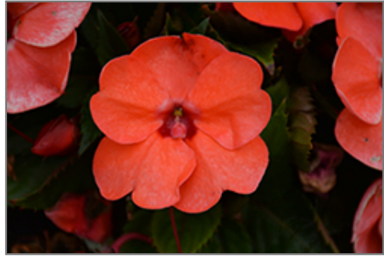
SunPatens Compact Hot Coral New Guinea Impatiens flowers

This plant will require occasional maintenance and upkeep, and should not require much pruning, except when necessary, such as to remove dieback. It is a good choice for attracting bees and butterflies to your yard. It has no significant negative characteristics.