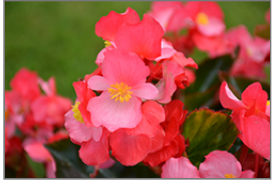
Surefire Rose Begonia flowers

Surefire Rose Begonia is an herbaceous annual with an upright spreading habit of growth. Its medium texture blends into the garden, but can always be balanced by a couple of finer or coarser plants for an effective composition.