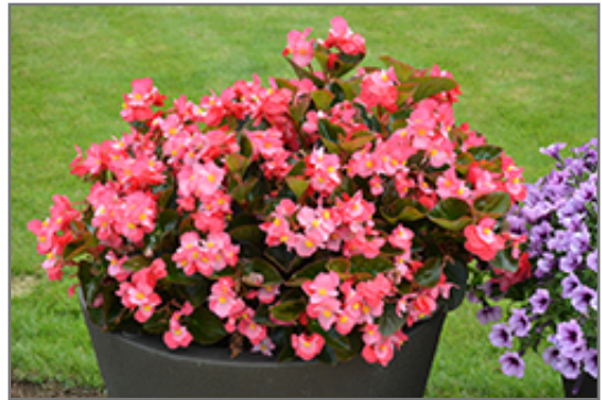
Surefire Rose Begonia in bloom