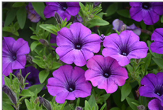
Supertunia Indigo Charm Petunia flowers