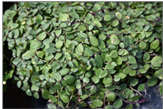
County Park Star Creeper foliage