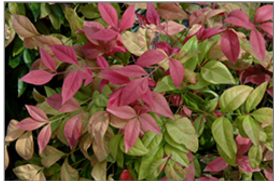
Blush Pink Nandina foliage

Blush Pink Nandina is recommended for the following landscape applications;