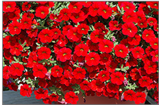
Cabaret Bright Red Calibrachoa flowers

This plant will require occasional maintenance and upkeep. Trim off the flower heads after they fade and die to encourage more blooms late into the season. It is a good choice for attracting bees and hummingbirds to your yard, but is not particularly attractive to deer who tend to leave it alone in favor of tastier treats. It has no significant negative characteristics.