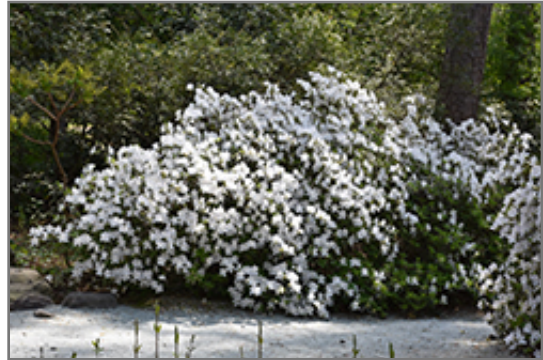
Delaware Valley White Azalea in bloom