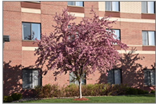
Robinson Flowering Crab in bloom

Robinson Flowering Crab is recommended for the following landscape applications;