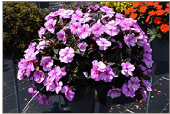
SunPatiens Vigorous Lavender Splash New Guinea Impatiens in bloom

SunPatiens Vigorous Lavender Splash New Guinea Impatiens is a fine choice for the garden, but it is also a good selection for planting in outdoor containers and hanging baskets. Because of its height, it is often used as a 'thriller' in the 'spiller-thriller-filler' container combination; plant it near the center of the pot, surrounded by smaller plants and those that spill over the edges. It is even sizeable enough that it can be grown alone in a suitable container. Note that when growing plants in outdoor containers and baskets, they may require more frequent waterings than they would in the yard or garden.