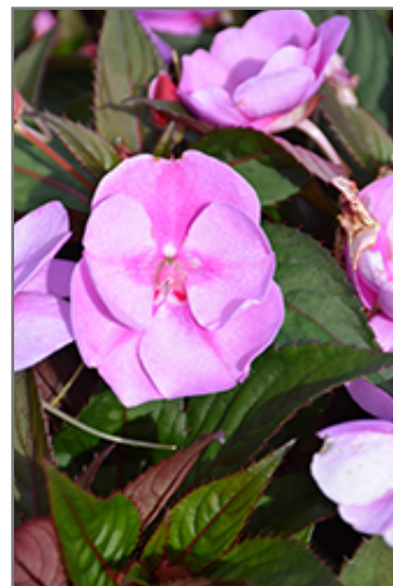
SunPatiens Vigorous Lavender Splash New Guinea Impatiens flowers