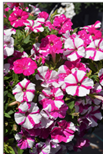
Headliner Pink Sky Petunia flowers

Headliner Pink Sky Petunia is recommended for the following landscape applications;