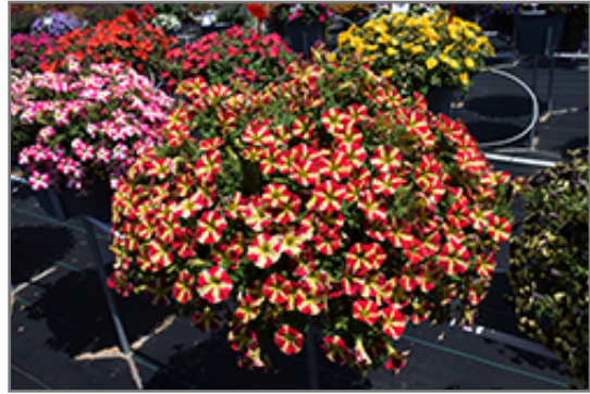
Amore Queen of Hearts Petunia in bloom

Amore Queen of Hearts Petunia is a fine choice for the garden, but it is also a good selection for planting in outdoor containers and hanging baskets. It is often used as a 'filler' in the 'spiller-thriller-filler' container combination, providing a mass of flowers against which the thriller plants stand out. Note that when growing plants in outdoor containers and baskets, they may require more frequent waterings than they would in the yard or garden.