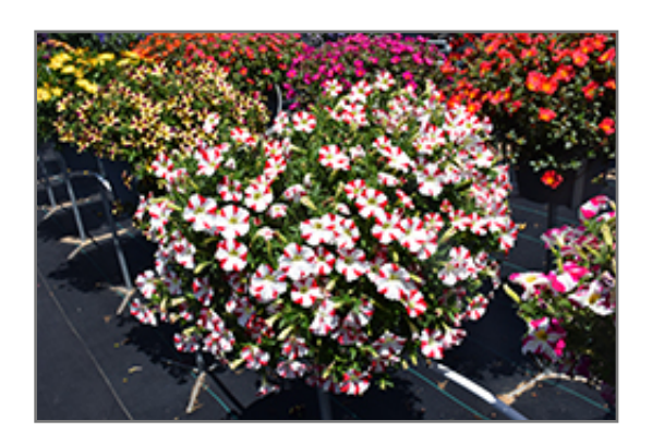
Amore King of Hearts Petunia in bloom

Amore King of Hearts Petunia will grow to be about 12 inches tall at maturity, with a spread of 14 inches. When grown in masses or used as a bedding plant, individual plants should be spaced approximately 10 inches apart. Its foliage tends to remain dense right to the ground, not requiring facer plants in front. This fast-growing annual will normally live for one full growing season, needing replacement the following year.