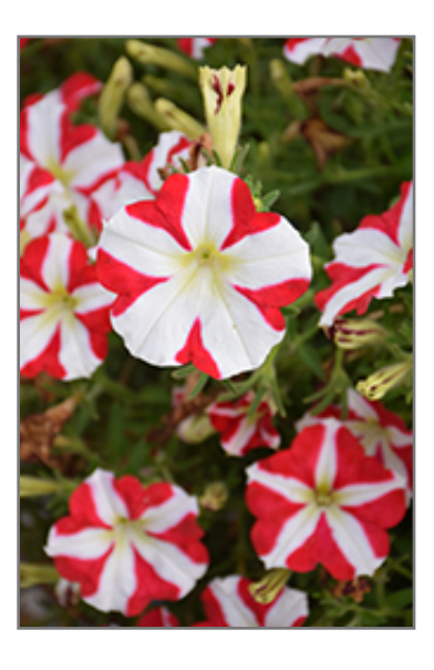
Amore King of Hearts Petunia flowers

Amore King of Hearts Petunia is recommended for the following landscape applications;