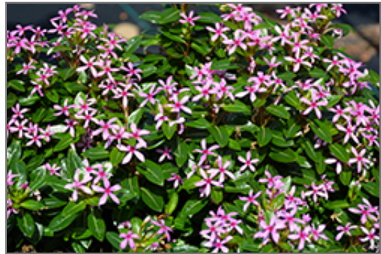
Soiree Kawaii Light Purple Vinca flowers

Soiree Kawaii Light Purple Vinca is recommended for the following landscape applications;