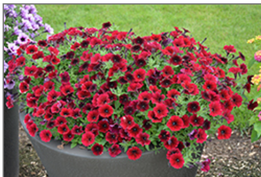
Supertunia Black Cherry Petunia in bloom