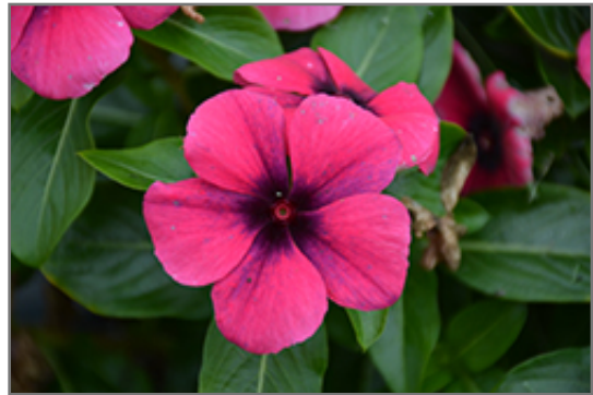
Tattoo Raspberry Vinca flowers

This plant will require occasional maintenance and upkeep, and should not require much pruning, except when necessary, such as to remove dieback. It is a good choice for attracting butterflies to your yard, but is not particularly attractive to deer who tend to leave it alone in favor of tastier treats. It has no significant negative characteristics.