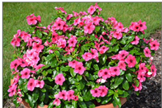
Tattoo Raspberry Vinca in bloom