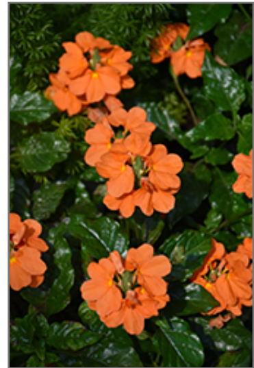
Orange Marmalade Firecracker Plant flowers

This plant does best in full sun to partial shade. It does best in average to evenly moist conditions, but will not tolerate standing water. It is not particular as to soil pH, but grows best in rich soils. It is somewhat tolerant of urban pollution. This is a selected variety of a species not originally from North America. It can be propagated by cuttings; however, as a cultivated variety, be aware that it may be subject to certain restrictions or prohibitions on propagation.