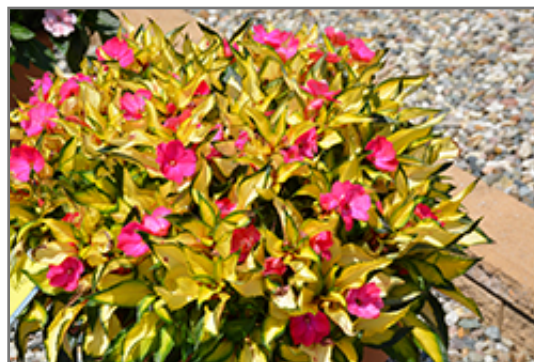
SunPatiens Compact Tropical Rose New Guinea Impatiens in bloom