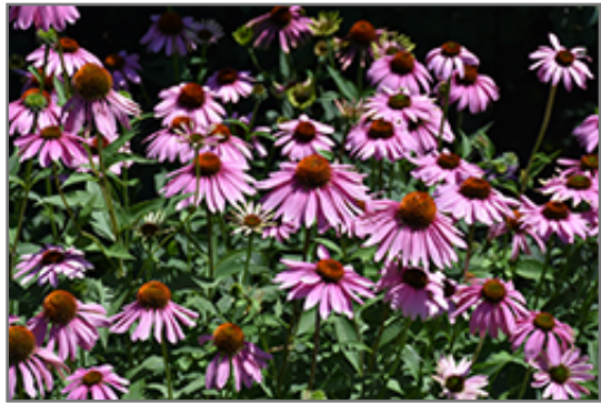
Magnus Coneflower flowers

Magnus Coneflower will grow to be about 24 inches tall at maturity extending to 3 feet tall with the flowers, with a spread of 24 inches. It grows at a medium rate, and under ideal conditions can be expected to live for approximately 10 years. As an herbaceous perennial, this plant will usually die back to the crown each winter, and will regrow from the base each spring. Be careful not to disturb the crown in late winter when it may not be readily seen!