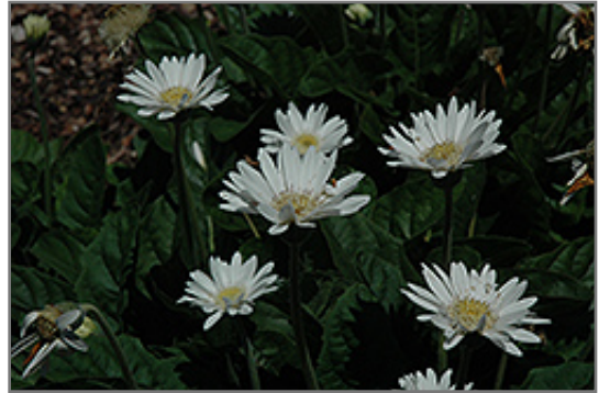
Garvinea Sylvana Gerbera Daisy flowers

When grown indoors, Garvinea Sylvana Gerbera Daisy can be expected to grow to be about 16 inches tall at maturity, with a spread of 18 inches. It grows at a fast rate, and under ideal conditions can be expected to live for approximately 3 years. This houseplant will do well in a location that gets either direct or indirect sunlight, although it will usually require a more brightly-lit environment than what artificial indoor lighting alone can provide. It does best in average to evenly moist soil, but will not tolerate standing water. The surface of the soil shouldn't be allowed to dry out completely, and so you should expect to water this plant once and possibly even twice each week. Be aware that your particular watering schedule may vary depending on its location in the room, the pot size, plant size and other conditions; if in doubt, ask one of our experts in the store for advice. It is not particular as to soil type or pH; an average potting soil should work just fine.