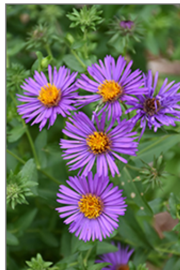
Purple Beauty Aster flowers