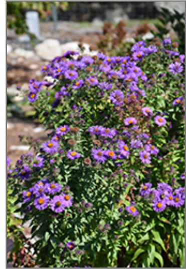
Purple Beauty Aster flowers

This plant does best in full sun to partial shade. It prefers to grow in average to moist conditions, and shouldn't be allowed to dry out. It is not particular as to soil type or pH. It is somewhat tolerant of urban pollution. This is a selection of a native North American species. It can be propagated by division; however, as a cultivated variety, be aware that it may be subject to certain restrictions or prohibitions on propagation.