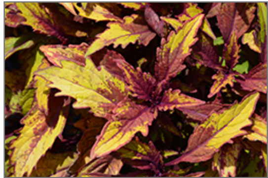
FlameThrower Spiced Curry Coleus foliage

FlameThrower Spiced Curry Coleus is recommended for the following landscape applications;