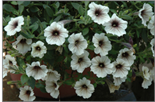
Supertunia Latte Petunia flowers