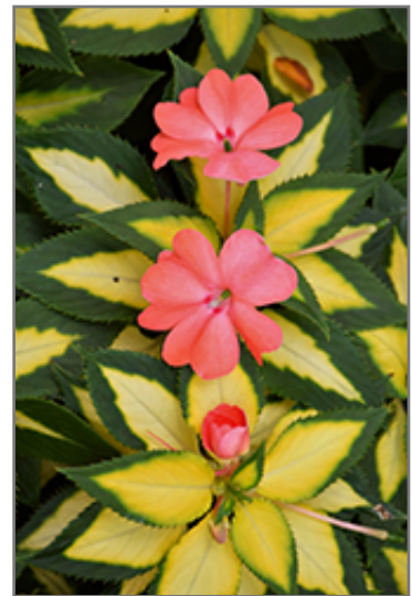
SunPatiens Spreading Salmon New Guinea Impatiens flowers

This plant will require occasional maintenance and upkeep, and should not require much pruning, except when necessary, such as to remove dieback. It is a good choice for attracting bees and butterflies to your yard. It has no significant negative characteristics.