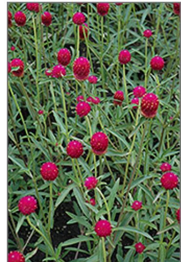
Qis Carmine Gomphrena flowers