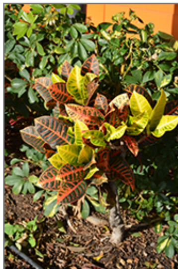
Variegated Croton