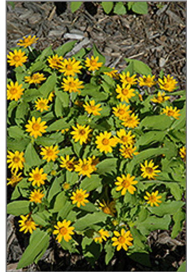
Million Gold Melampodium flowers