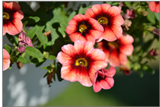
Superbells Coralberry Punch Calibrachoa flowers

Superbells Coralberry Punch Calibrachoa is a dense herbaceous annual with a trailing habit of growth, eventually spilling over the edges of hanging baskets and containers. Its medium texture blends into the garden, but can always be balanced by a couple of finer or coarser plants for an effective composition.