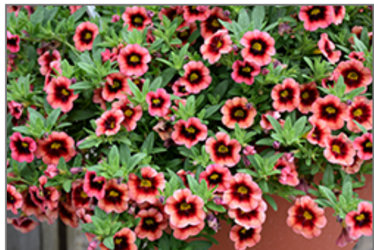
Superbells Coralberry Punch Calibrachoa flowers